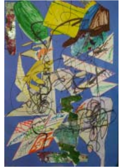
INSPIRED BY KANDENSKY

Green elms in the woods Some old, some new, but still Standing tall and proud