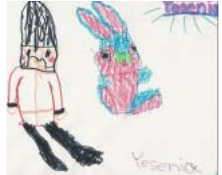
Artist: Yesenia, age 9