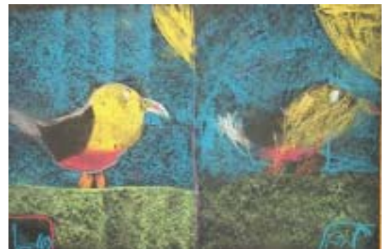
Artist: Yolanda, age 8