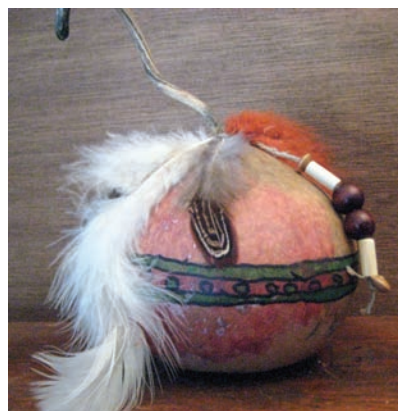
Native American Gourd