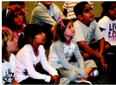
The Faces of Tools for Tomorrow

The mission of TFT is to provide free after-school integrated arts programs to the children of the Coachella Valley, but it is much more than that as past history has proven. TFT opens the creative spirit, hearts and minds of the children we serve. Ours is a multi-cultural, diverse population of children who would NEVER have the opportunities that TFT offers them. We have come to you in the past asking you to open your pocketbooks and help us in our mission, but now, we come to you asking you to open your hearts to assure that the children of Tools for Tomorrow may continue to receive those opportunities that we offer them: