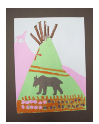
Unsigned: third grade

Once there was a bighorn named Buford. Buford the mighty, strong and brave. One day he went to the mountains and suddenly he finds a gorgeous and friendly mate. Then Buford walks up to her and he says, "Would you be my mate?" And she says, "Yes."