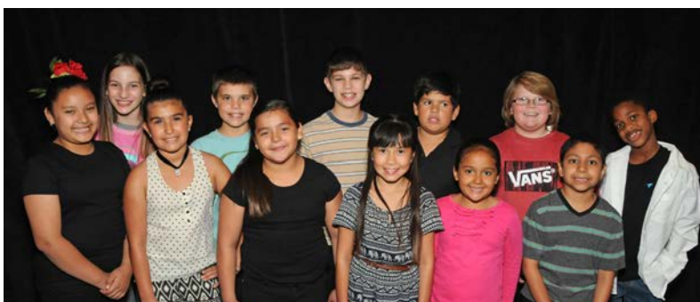
TFT Rancho Mirage School Players