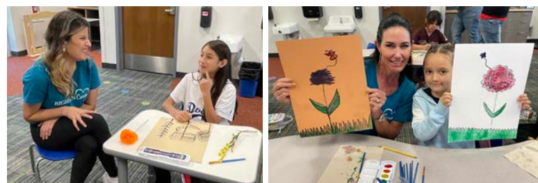
BIGHORN Cares visits TFT at Agua Caliente ES