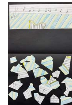
Delilah, Grade 3