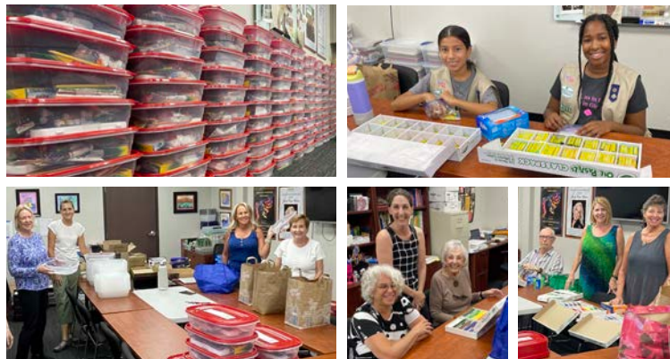
Volunteers Assembling Art Kits in the TFT Office

THANK YOU to the TFT Board Members and Volunteers who assembled Art Kits.