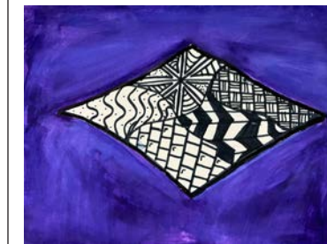
Brooklyn, Grade 5