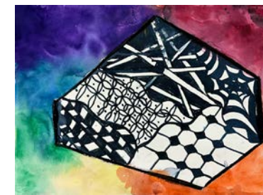
Jesus, Grade 5