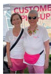
TFT Volunteers at La Quinta Art Celebration