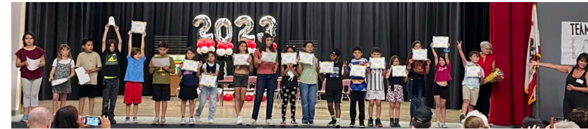
Theatre Troupe Performance by the students at Harry S. Truman Elementary School in La Quinta, CA

This show was created through improvisation. It included games and character work. Through honest and open discussion, trust, play and collaboration, the musical evolved into a message with achievable solutions on the widespread issue of bullying.