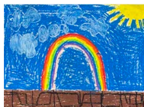
DONATIONS - July 2022 - October 2023